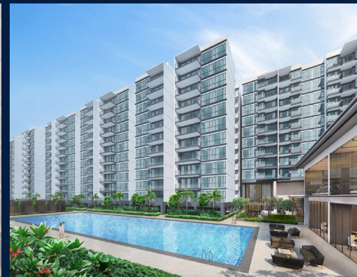
5 - Bedroom